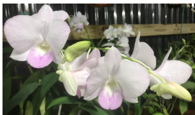
Dendrobium Burana Pearl