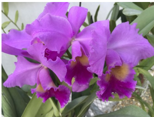
Rhyncholaeliocattleya Spring Dawn