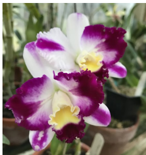
Cattleya Hsinying Excell