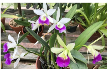
Bc Hawaii Stars